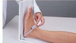
3 Take circumferential measurement around the instep and heel at maximal dorsiflexion (flex toes toward head).