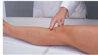
7 Measure circumference D and length D at the tibial tuberosity (two finger widths below the kneecap).