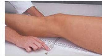
8 Measure length E to the middle of the kneecap with the leg extended.