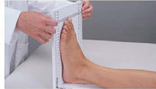
2 Foot length closed toe : from the tips of the toes to end of the heel. Foot length open toe : from the 5th MTP joint to the end of heel. (Best taken from foot outline).