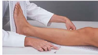
6 Measure circumference C and length C at the greatest calf circumference.