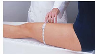
10 Measure circumference F and length F at the middle of the thigh.