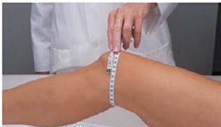
9 Measure circumference E (knee circumference) at the middle of the patella (kneecap), with the leg flexed at a 45° angle.