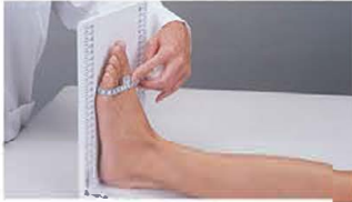
1 Take circumferential measurement A at the 5th MTP (base of little toe) joint.

Use sewing tape to wrap around leg areas. Record measurements where the tape touches together without pulling.