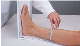
5 Measure circumference B1 and length B1 at the Achilles tendon/calf transition (8-10 cm above B).