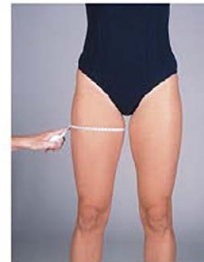
11 Measure circumference G and length G at the greatest thigh circumference.