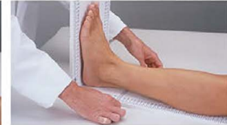
4 Measure circumference B and length B above the ankle at the narrowest point of the calf.